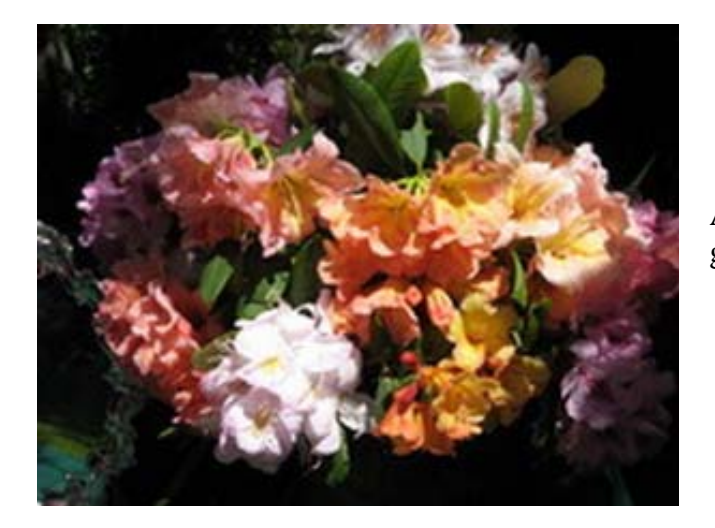
A bouquet of rhododendron hybrids grown by the Murrays