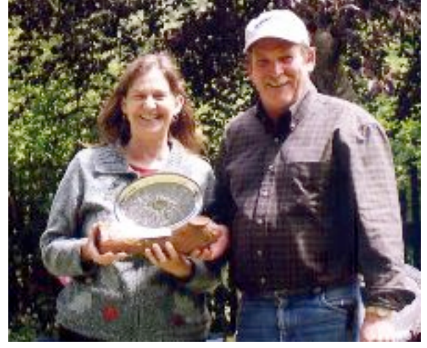
The de Rothschild Challenge Trophy Best Rhododendron in Show B&B Gordon for R. "Horizon Monarch"